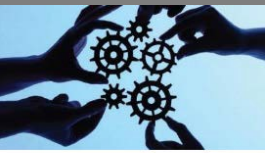
Challenging the System