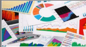
Figure It Out!