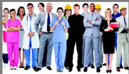
I Could DO That!