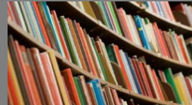
Analyzing Awesome Authors